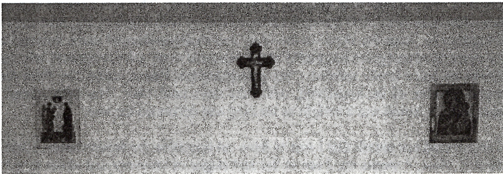
Icon on left - The Annunciation